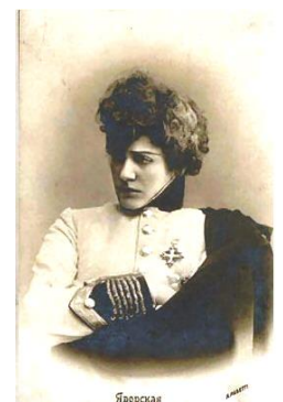
Example only - actual designs will vary