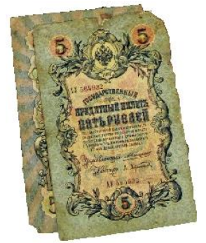
Indication of condition - individual notes vary

to NatWest Account No: 57125546 in the name of Mr JA and Mrs JI Simpson Sort Code 60-19-17